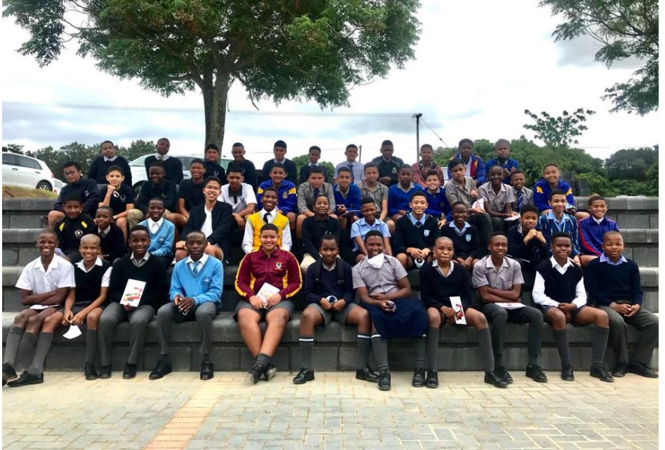
Learners at the new boy day in their primary school uniforms. Everyone always wore masks and only removed it seconds before the photo.

After a year like no other, we are acutely aware of how fragile we are and how much we have to be grateful for. Despite the challenges of this year, Calling Academy is still thriving, and we are very excited about the continued growth and future possibilities.