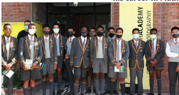
ABOVE: All the learners taking Art as a subject visited the Stellenbosch Academy for Design and Photography (a tertiary institution).

In keeping with exposure being a high value at Calling, interesting excursions took place recently.