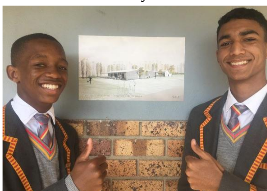
LEFT: Two Grade 11's at an image of the envisioned building.